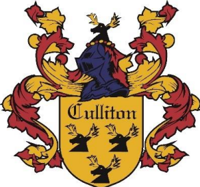
Gunterberg Charitable Foundation